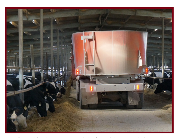
Handle and feed young animals before older animals, leaving sick or treated cattle until last to limit disease spread; or use dedicated equipment and personnel for each group.