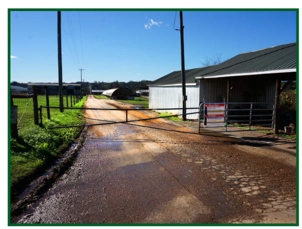
Identify and clearly mark a "Line of Separation" (LOS) between on-site and off-site movements and activities. Inform those who need to cross the LOS of the required biosecurity protocols.