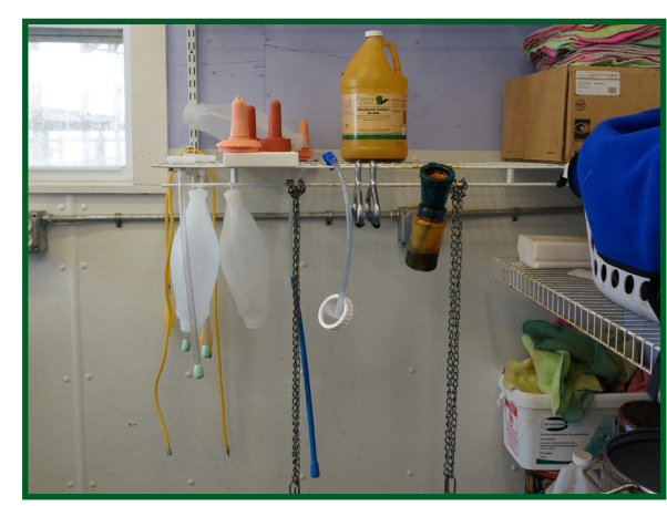
Instruments or equipment contacting blood, tissues, used in the mouth, or treating sick animals should be cleaned and disinfected between animals of different health status.