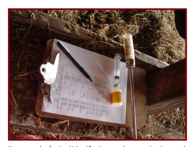
Keep records of animal identification numbers, vaccinations, and treatments given, at a minimum. In a disease outbreak, records of all animal, vehicle, and people movement onto and off of the operation should be kept.