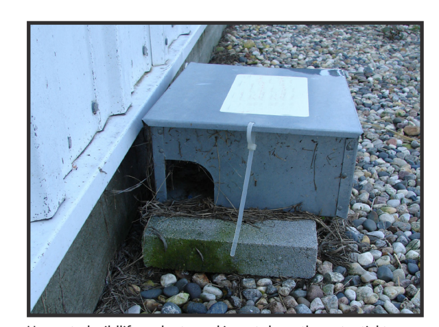
Unwanted wildlife, rodents, and insects have the potential to spread a variety of diseases to cattle; utilize integrated pest management programs.