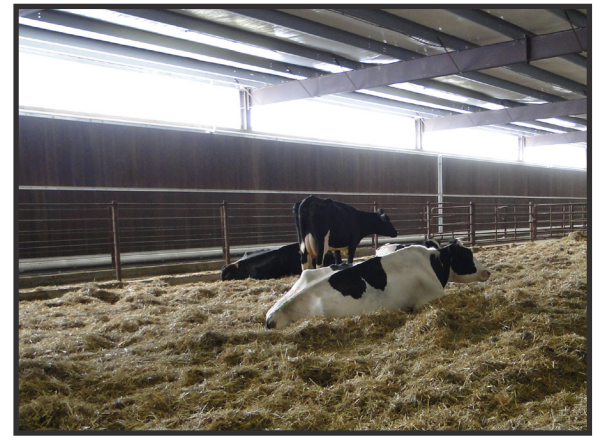
Incoming cattle can introduce disease to the herd of origin unless quarantined and managed separately for a period of time. Observe, test, and vaccinate as recommended by your veterinarian.