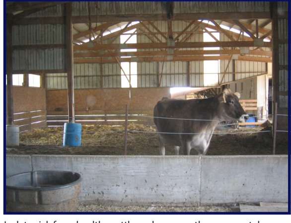
Isolate sick from healthy cattle and manage them separately. Personnel handling sick cattle should be dedicated to that task; with limited personnel, wash hands and all equipment used and change clothing/footwear after working with sick animals.