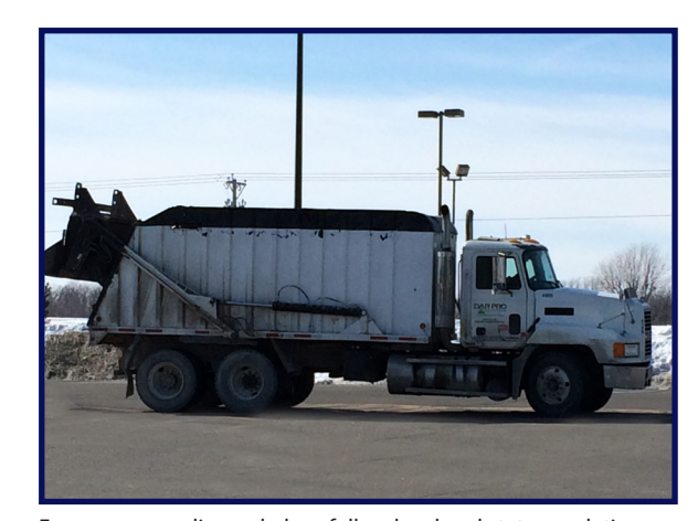
to prevent environmental contamination. Prevent the rendering truck from sharing drive paths with on-site vehicles or passing near live cattle to limit disease introduction. Protect carcasses from scavengers that can spread disease.