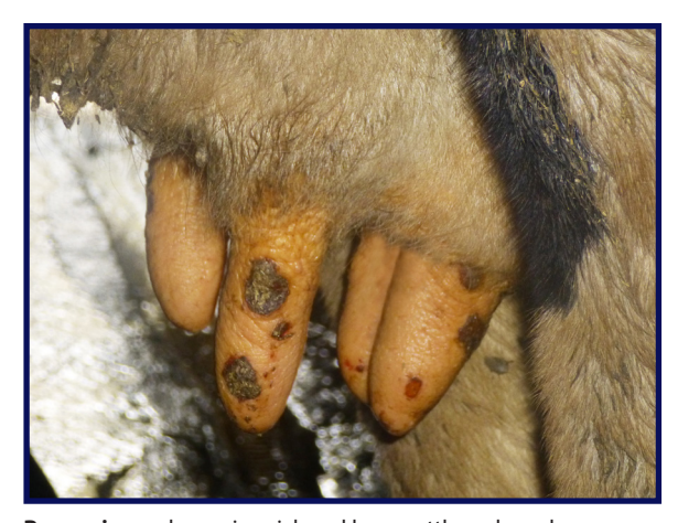
immediately report any vesicles on cattle to animal health authorities. This cow has ruptured vesicles on her rear teats caused by Foot and Mouth Disease (FMD).