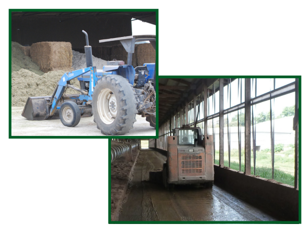
Dedicate equipment to your operation and task whenever possible. Avoid using the same equipment for handling manure, dead animals, and feed unless it is thoroughly cleaned, disinfected, and allowed to dry after use.