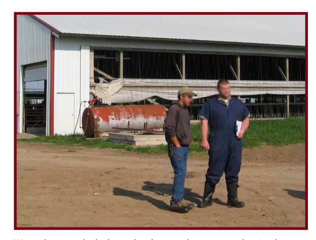
Wear clean work clothing that has not been around animals on other operations and footwear that can be cleaned when moving between animal groups.